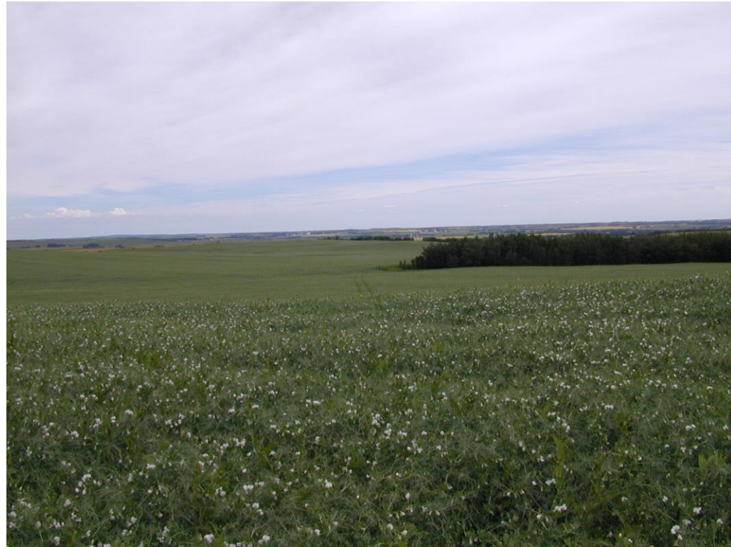
Flowering stage – Field pea crop

Headlands of field (avoid or assess separately)