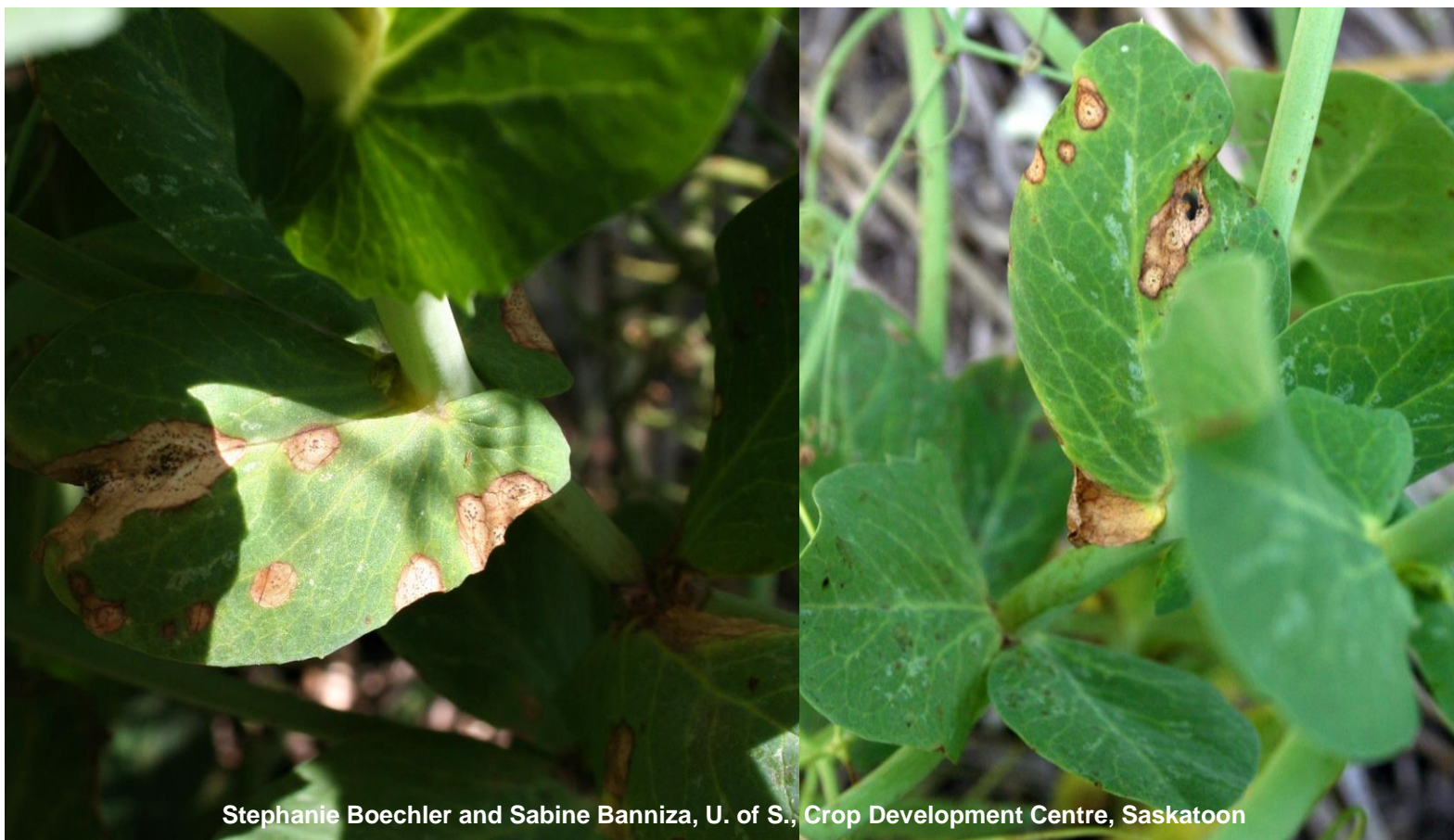
Stephanie Boechler and Sabine Banniza, U. of S., Crop Development Centre, Saskatoon

Note distinct blackish pepper spots or bumps (pycnidia) that cover lesion surfaces. With moist conditions these pycnidia (asexual fruiting bodies) can ooze masses of pycnidiospores.